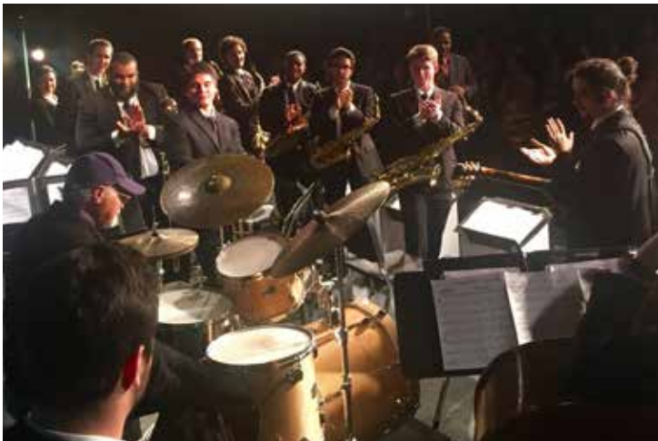
Members of MSU Jazz Orchestra 1 applaud the talent exhibited by Jimmy Cobb during their performance at Hackett Catholic Central.

"The generosity of the MSU Federal Credit Union has made it possible for us to bring in artists who have significantly shaped this great American art form we call jazz," said Whitaker. "We're exceptionally grateful for their visionary gift that allows us to achieve the highest standards of excellence in jazz education and performance."