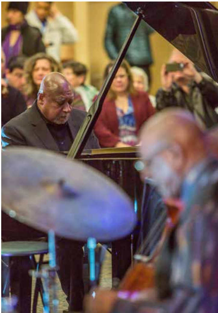
Kenny Barron performs at the MSU Federal Credit Union Blue Mondays concert.