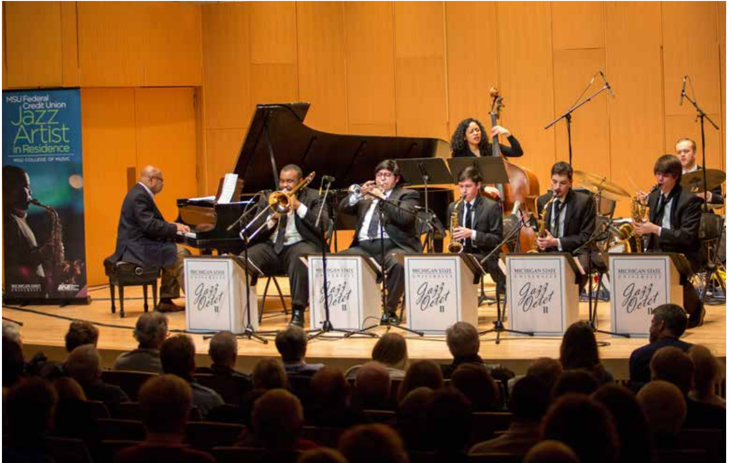
Kenny Barron performs with MSU Octets at Cook Recital Hall in the College of Music.