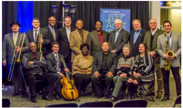
Kenny Barron takes a moment to pose for a photo with the MSU Professors of Jazz and MSU Federal Credit Union board members after the Blue Mondays concert.