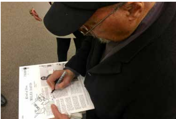
Jimmy Cobb takes a moment to offer his autograph for fans during his tour of select Michigan high schools.