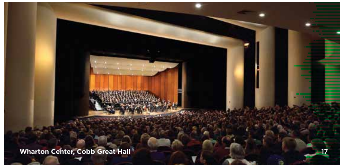
Wharton Center, Cobb Great Hall