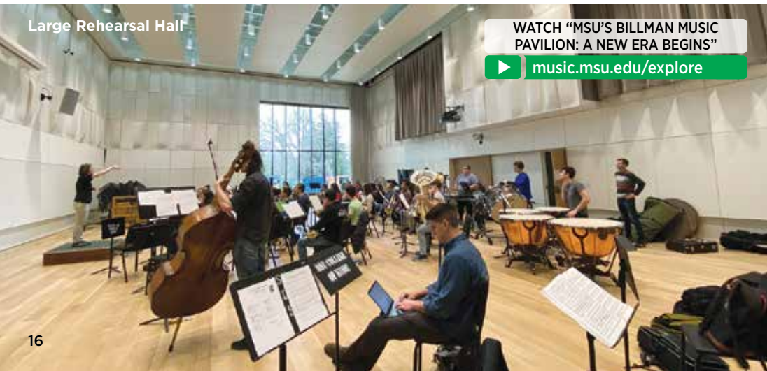
Large Rehearsal Hall

WATCH "MSU'S BILLMAN MUSIC PAVILION: A NEW ERA BEGINS"