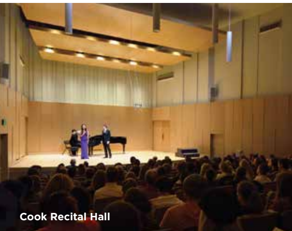
Cook Recital Hall

The Wharton Center's Cobb Great Hall, which seats 2,420, is used for most College of Music large ensemble performances. Wharton's Pasant Theatre with its thrust stage and intimate ambiance seats 596 and hosts a variety of performances each year. 🎭