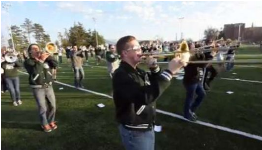
The Spartan Marching Band is presenting an extravagant halftime show during Saturday's football game against Maryland.

The performance will be held when the Spartans (8-1) take on the Maryland Terrapins (2-7) at noon Saturday.